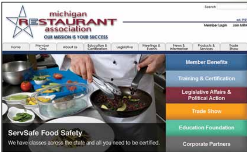
ICS reduced MRA's costs with a re-usable, online enrollment & payment processing tool for 25,000 exhibitors and attendees.

Marketers need a cost-effective, simple way to enroll or register customers, prospects, employees, members, students and others into various programs and events. Sometimes, you need even a little more help – such as payment processing, downloadable certificates and integration with your overall marketing strategy.